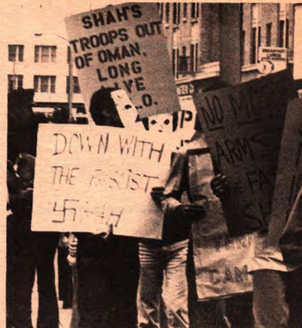
FACIST SHAH'S MASS EXECUTIONS RECEIVED WORLD-WIDE PROTEST

Following the arrest of the six at the May 28th demonstration, the Immigration and Naturalization Service (INS) has begun deportation proceedings against one of the arrested. If this deportation succeeds, torture and pos-