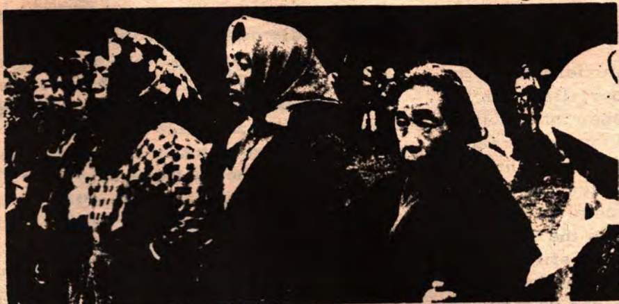
Let the People Speak!

Name _____ Address _____ City _____ State _____ Zip _____