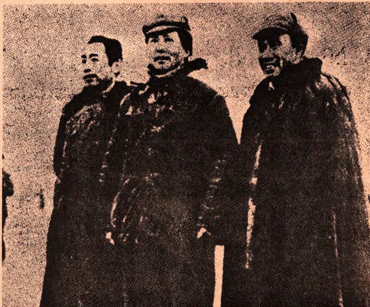
COMRADES-IN-ARMS CHOU EN-LAI, MAO TSETUNG AND CHU TEH LEAD THE MEN IN THE FAMOUS LONG MARCH WHICH BEGAN IN 1934 TO ITS HISTORIC VICTORY.