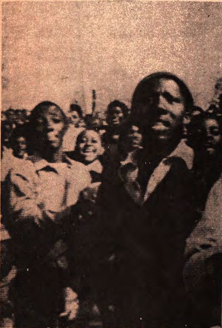
STUDENTS RIOTING IN SOWETO, SOUTH AFRICA IN OPPOSITION TO THE FORCING OF THE AFRIKAAN LANGUAGE IN SCHOOLS.