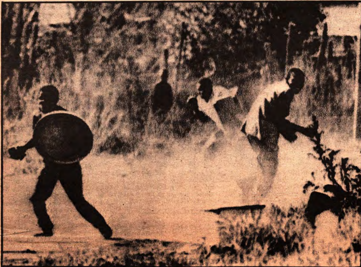
USING ROCKS AND BRICKS, BLACK AFRICANS FIGHT THE RACIST APARTHEID REGIME.