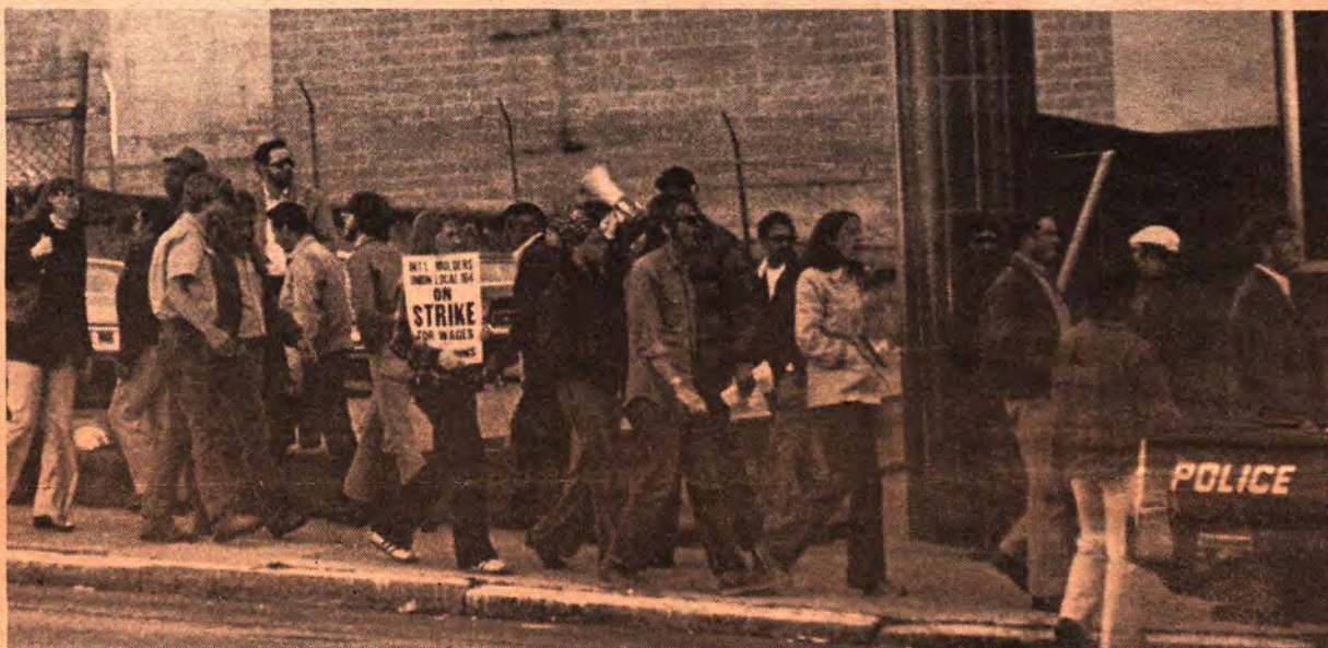
STRIKING MOLDERS AND SUPPORTERS PROTEST SHAM TRIAL OF LOCAL LEADERS AT UNION HEADQUARTERS